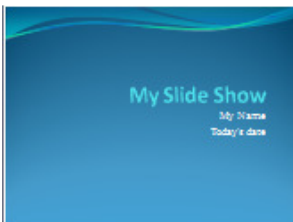
“Flow” theme showing graphics

If you check this box, the graphics that are included with your theme will be hidden. For example, if graphics are hidden on the “Flow” theme, here's what it looks like: